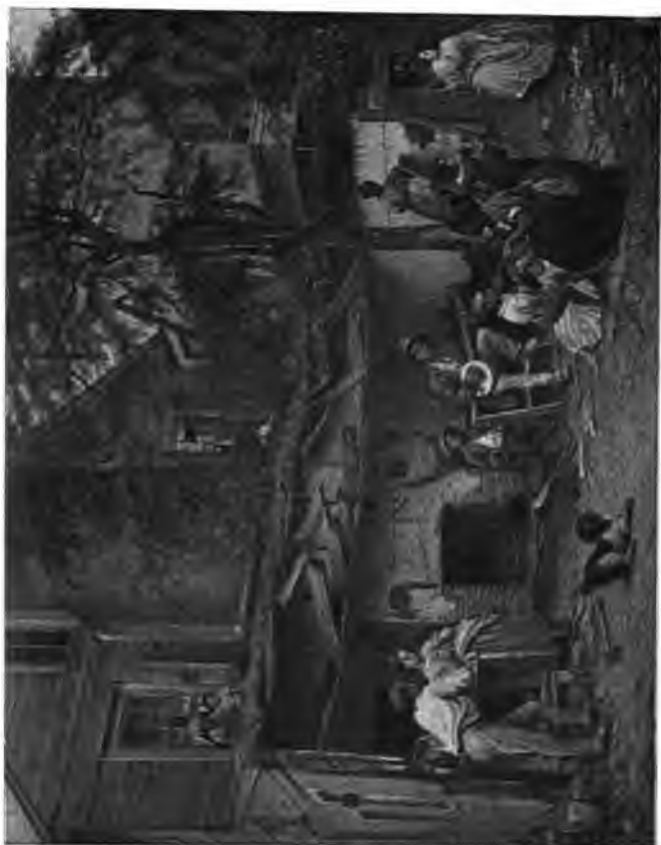
OLD KENTUCKY HOME From the painting by Eastman Johnson. In the New York Public Library